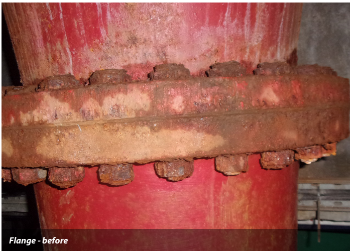
Flange - before

Barhale was appointed by Thames Water to carry out refurbishment works at Barrow Hill Shaft, one of a total of 22 on the ring main. Located at St. Edmunds Terrace on the edge of Primrose Hill in North London, Barrow Hill is the deepest of the shafts at 80m deep and also the biggest with a four way tunnel connection at its base.