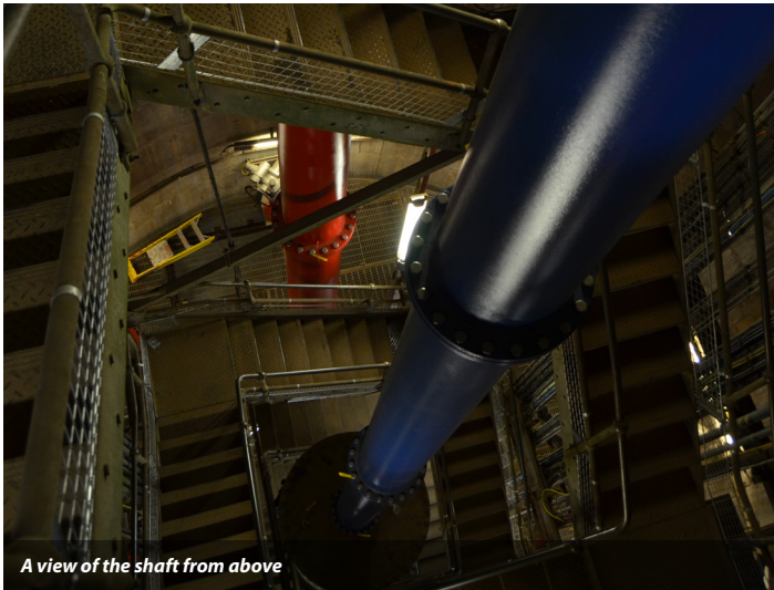
A view of the shaft from above