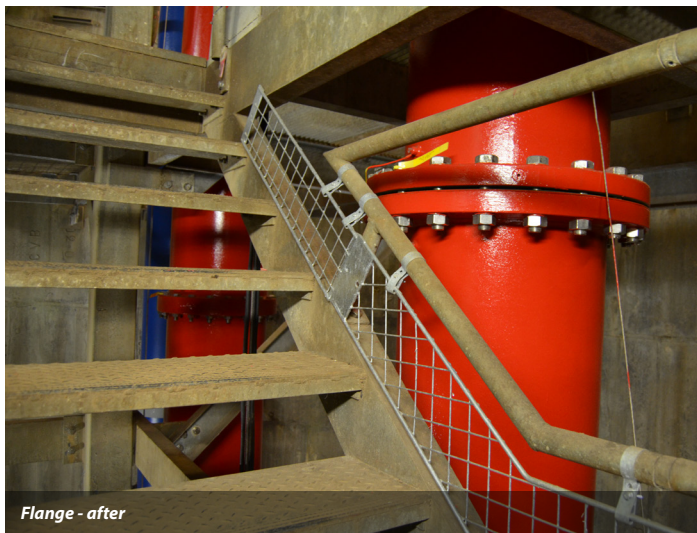
Flange - after