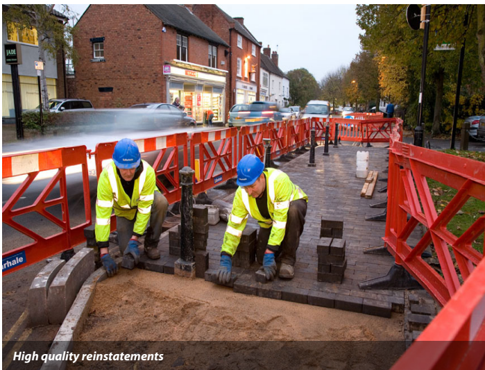
High quality reinstatements