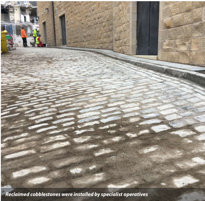
Reclaimed cobblestones were installed by specialist operatives