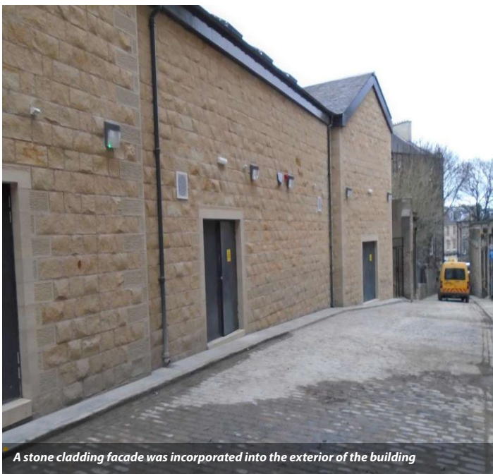
A stone cladding facade was incorporated into the exterior of the building