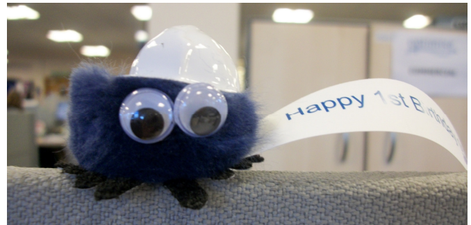
There are a limited number of Optimise Birthday Bugs left. If you would like one for your desk, vehicle or kids, please email faq@optimise.co.uk or call 07939 947745.

Year Two promises to be equally if not more challenging with VOWD targets more than doubling, the introduction of new systems in Thames Water Opex and Thames Water's cultural change programme. Year Two's focus is on delivery and efficiency; we should be challenging everything to ensure we delight our client and deliver the return on investment our parent companies expect.